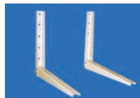
Foot Riser for Outdoor Unit