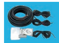
Accessory Kit (Copper/Wiring Set, Piping Wrap, Wall Sleeve, Putty, Drain Hose)

YMGI Group New Energy is the Sole Owner & User of YMGI Brand. Any Infringement Is to Be Prohibited and Prosecuted. Reporting or Assisting to Stop Any Infringement is to Be Rewarded.