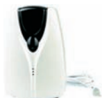
Phone-AC/HP Control (Call to Control from Anywhere)