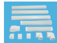
Copper Lineset Covers