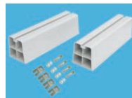
Bracket for Outdoor Unit